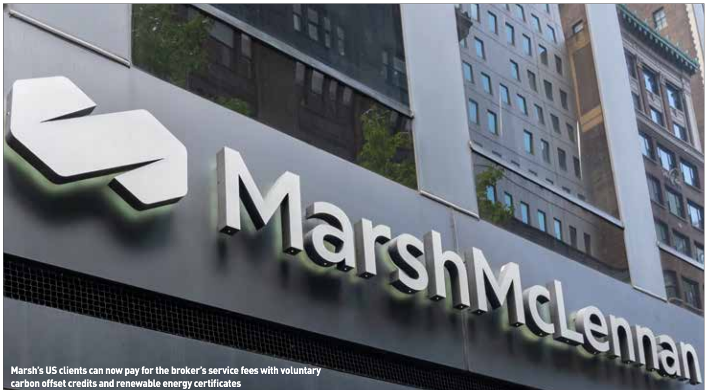
Marsh's US clients can now pay for the broker's service fees with voluntary carbon offset credits and renewable energy certificates

RECs are records of renewable electricity generation and are issued to organisations when one megawatt-hour of electricity is generated and delivered to the electricity grid from a renewable energy resource.