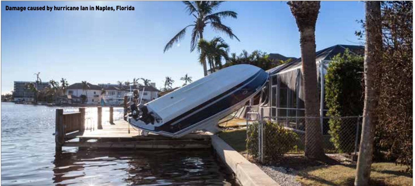
Damage caused by hurricane Ian in Naples, Florida

data is of good quality and views of risk and inflation are properly articulated, good outcomes are still possible. Cedants that are not in this position will likely be facing some very difficult conversations,” he said.