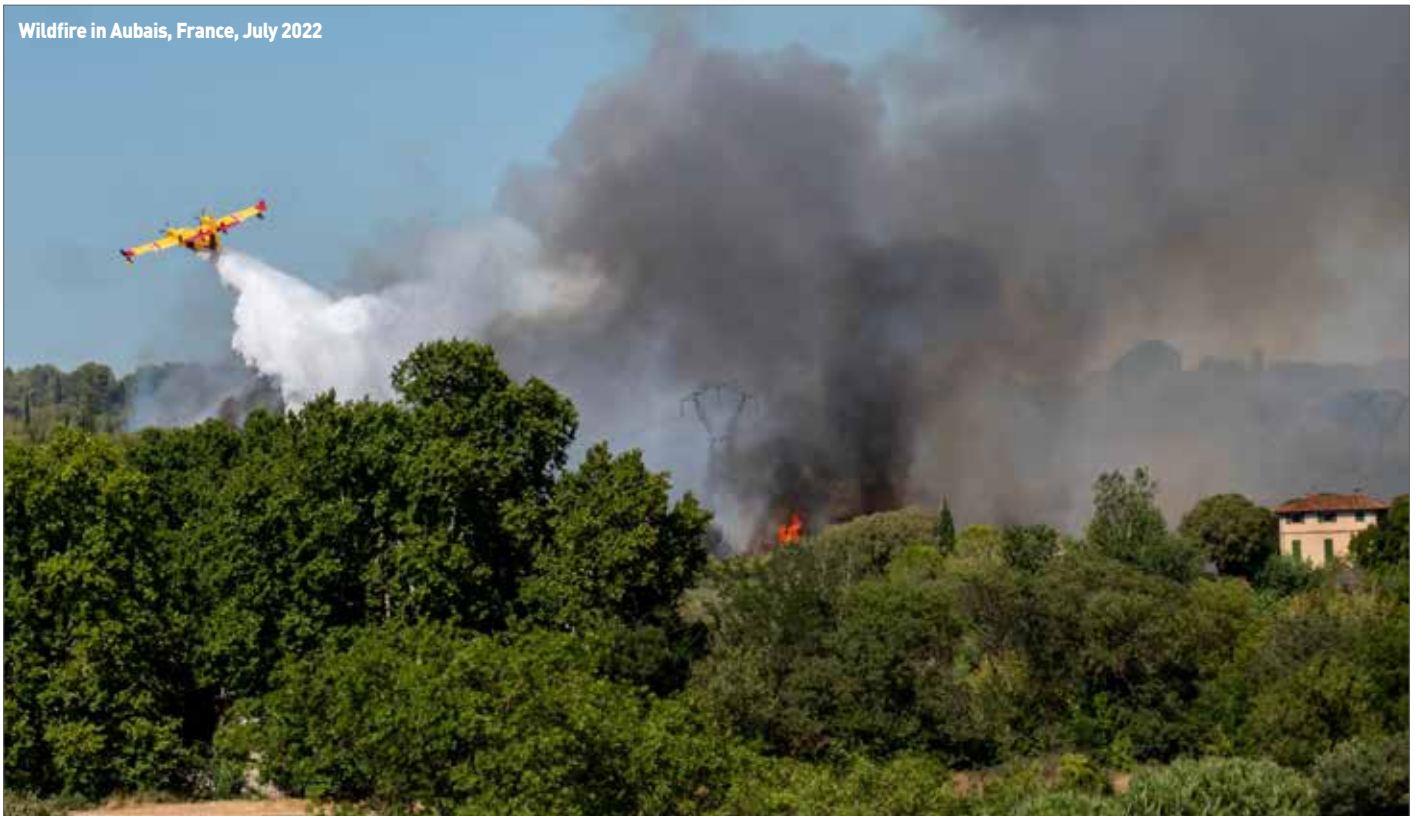
Wildfire in Aubais, France, July 2022

“We must have open and honest discussions with clients. We need to understand their risks and they need to understand how we can support them. I am confident that we have increasing numbers of well-informed and educated risk managers who are delivering a professional service to their employers and who can make the most of managing their risks through the insurance markets,” he concluded.