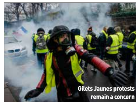
Gilets Jaunes protests remain a concern

There remain concerns about the Yellow Jackets in France and more strikes. Meanwhile, France has not been immune to the energy price hikes seen across much